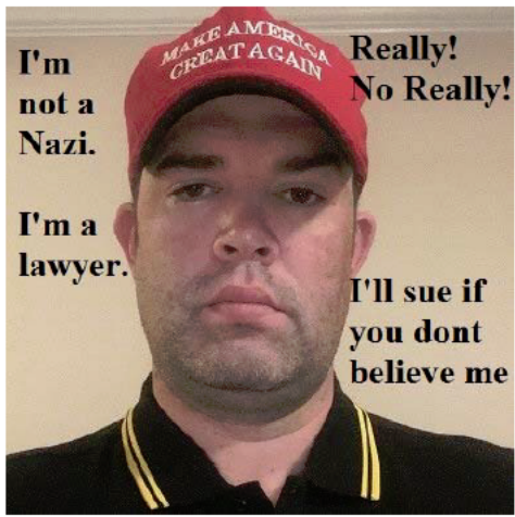
Author: Gerry Bello (/co te /tgerry-bello)